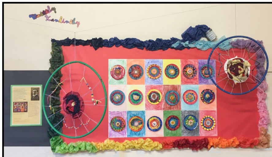
Wassily Kandinsky circles and Weaving by Foundation Stage

On Monday 16th January we held an Art Day across the school. This gave each class the opportunity to study an artist or a style of art in depth and to really develop their art skills. Everyone thoroughly enjoyed the day and the children were very proud of their work. If you haven't had a chance to come and see the work that is displayed in the school hall, do pop in at the start or end of the day.