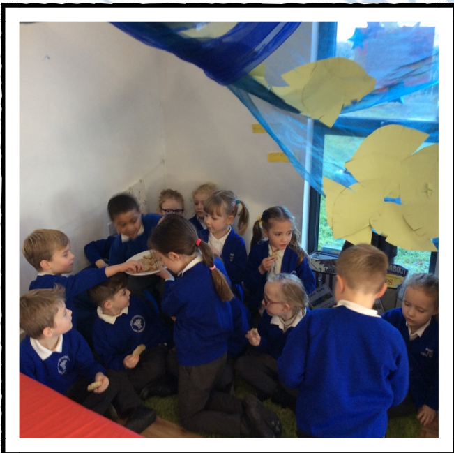
Sharing bread and honey in a makeshift Sukkah (Judaism)

It was great to hear the level of discussion from the children. One child commented: "Our school is so special because we love God so much. "Their friend replied "yes, but we love everyone from every religion. Don't we?"