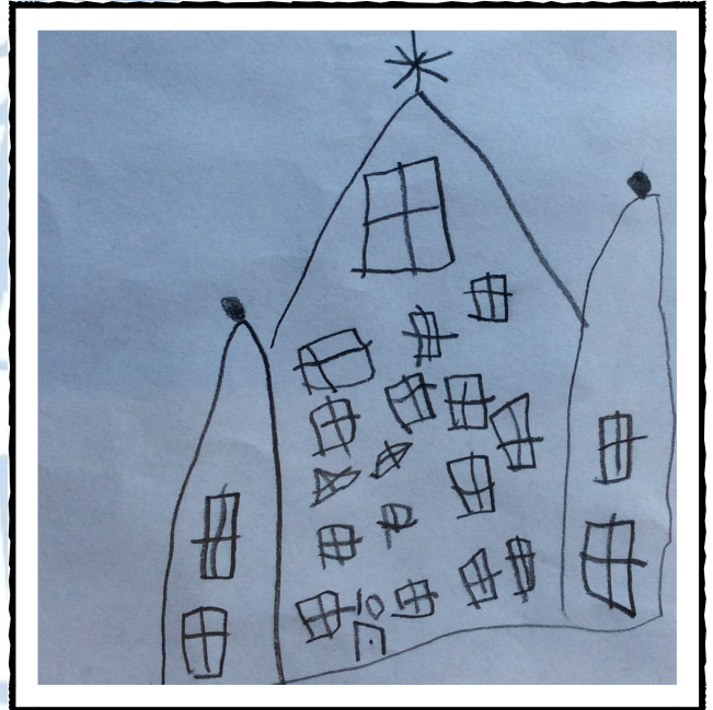
A drawing of a church (Christianity)