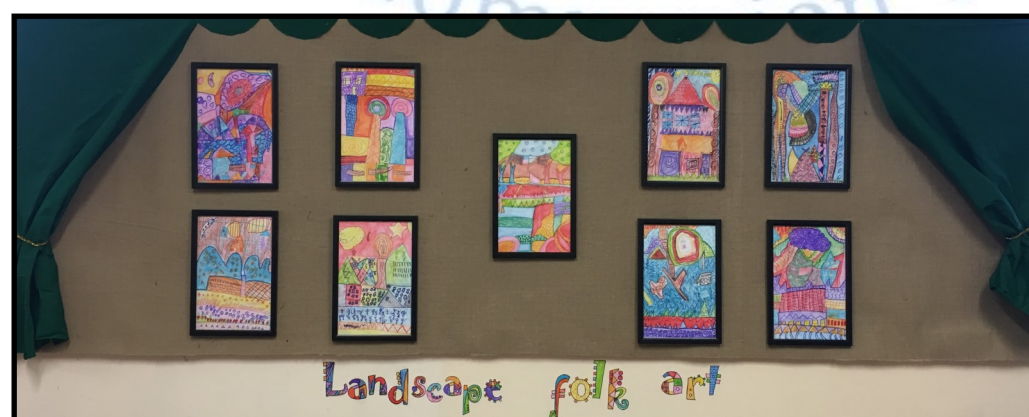
Folk Art Local Scenes in Watercolours by Class 2