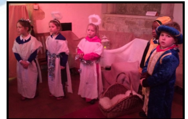
The Christmas Experience