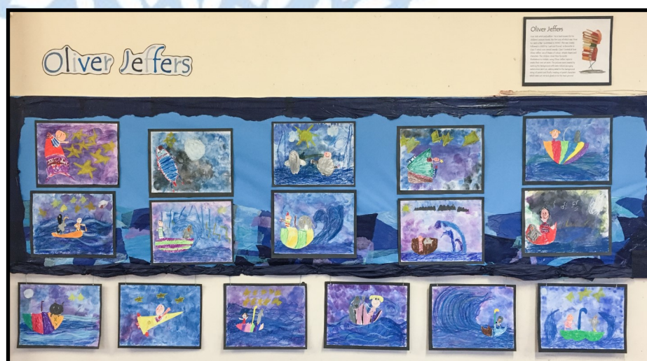
Oliver Jeffers Sea and Sky scapes in Oil Pastels by Class 1